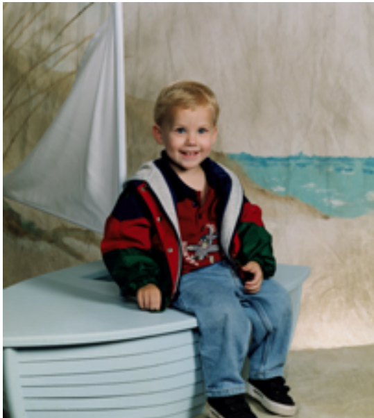
Sailboat scene. Lakeshore muslin Bgnd also available. Boy is about 2.5 yrs.