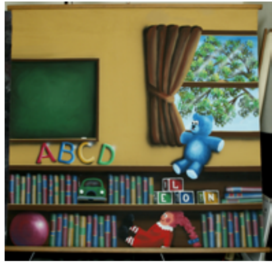
Kindergarten Classroom 6x8'