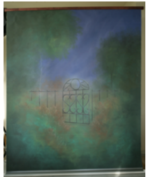
Wrought Iron Fence (SM850) 6x8'

ALL BACKGROUNDS ARE ON PAINTED ON CANVAS ** W/ ADAPTERS FOR HANGING ON LIGHT STANDS (or etc.). ALL ARE EASILY ROLLED UP FOR TRANSPORT AND STORAGE. ** The Christmas Bkgnd. is a photograph.