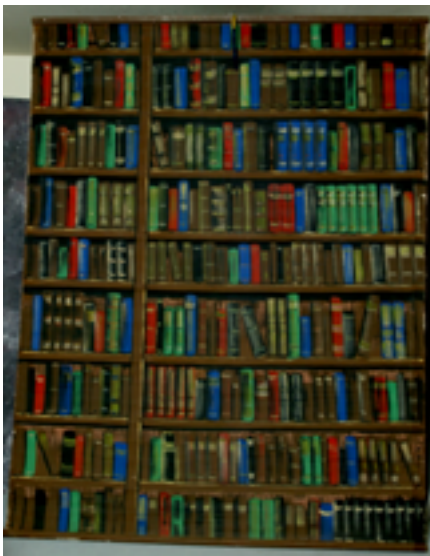
Book Case 6x7'