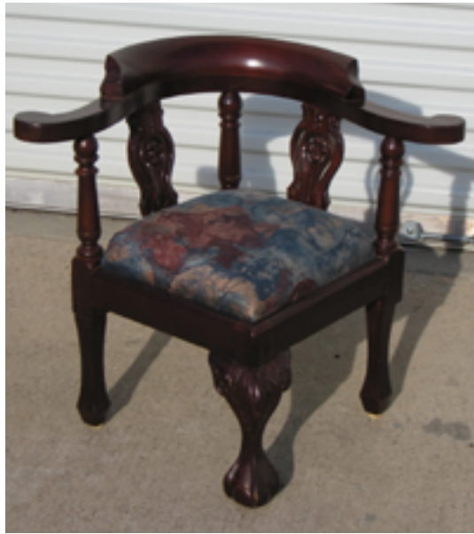
Corner Chair (Adult size, great for kids.)