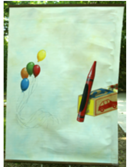
Baloons & Crayons 5x7'