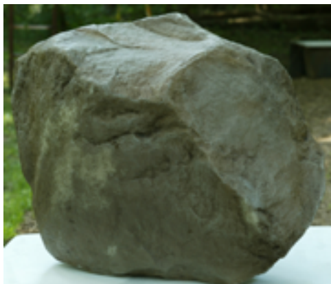
Boulder (Light wgt./hollow but sturdy.)