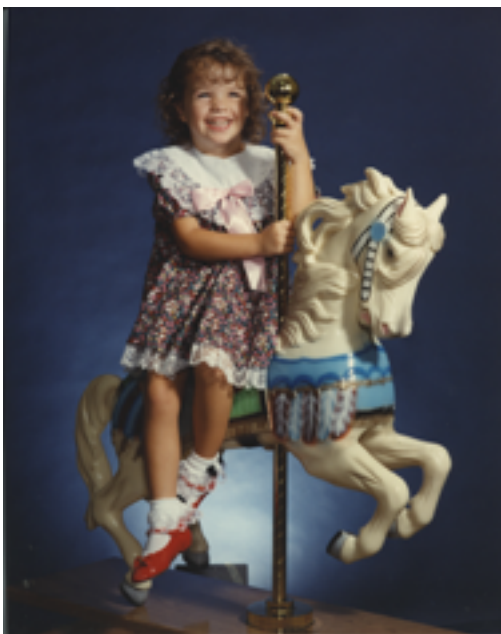
Carousel Pony scene. Girl is about 4 yrs.