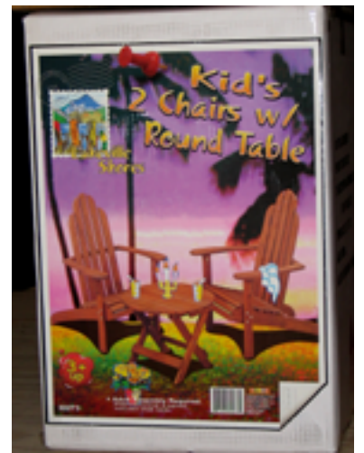
Patio Chair set