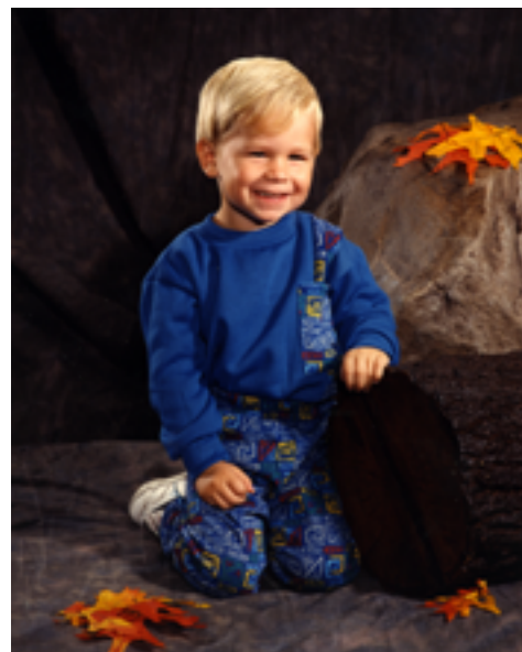
Boulder scene. Boy is about 3 yrs.