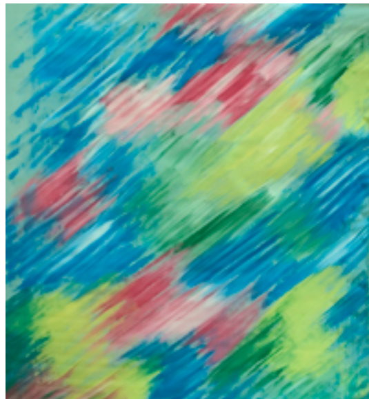
Pastel Patches 6x8'